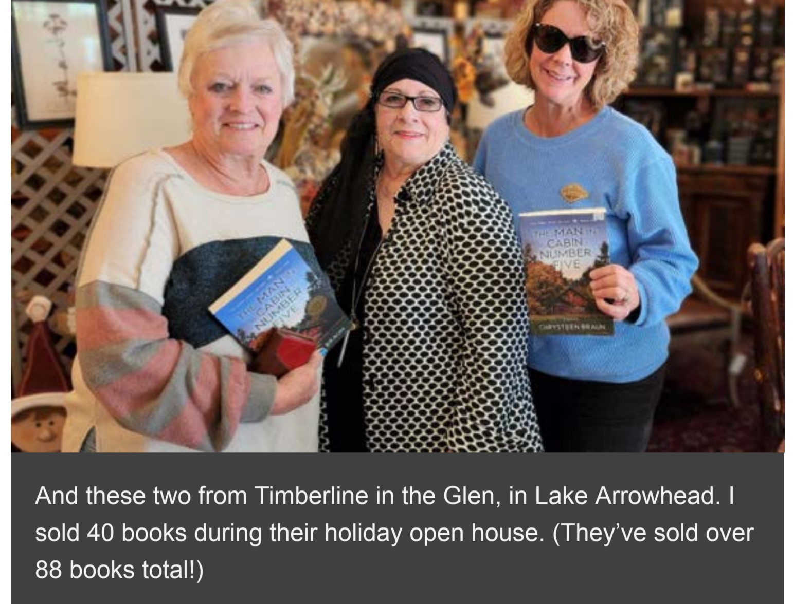
And these two from Timberline in the Glen, in Lake Arrowhead. I sold 40 books during their holiday open house. (They've sold over 88 books total!)