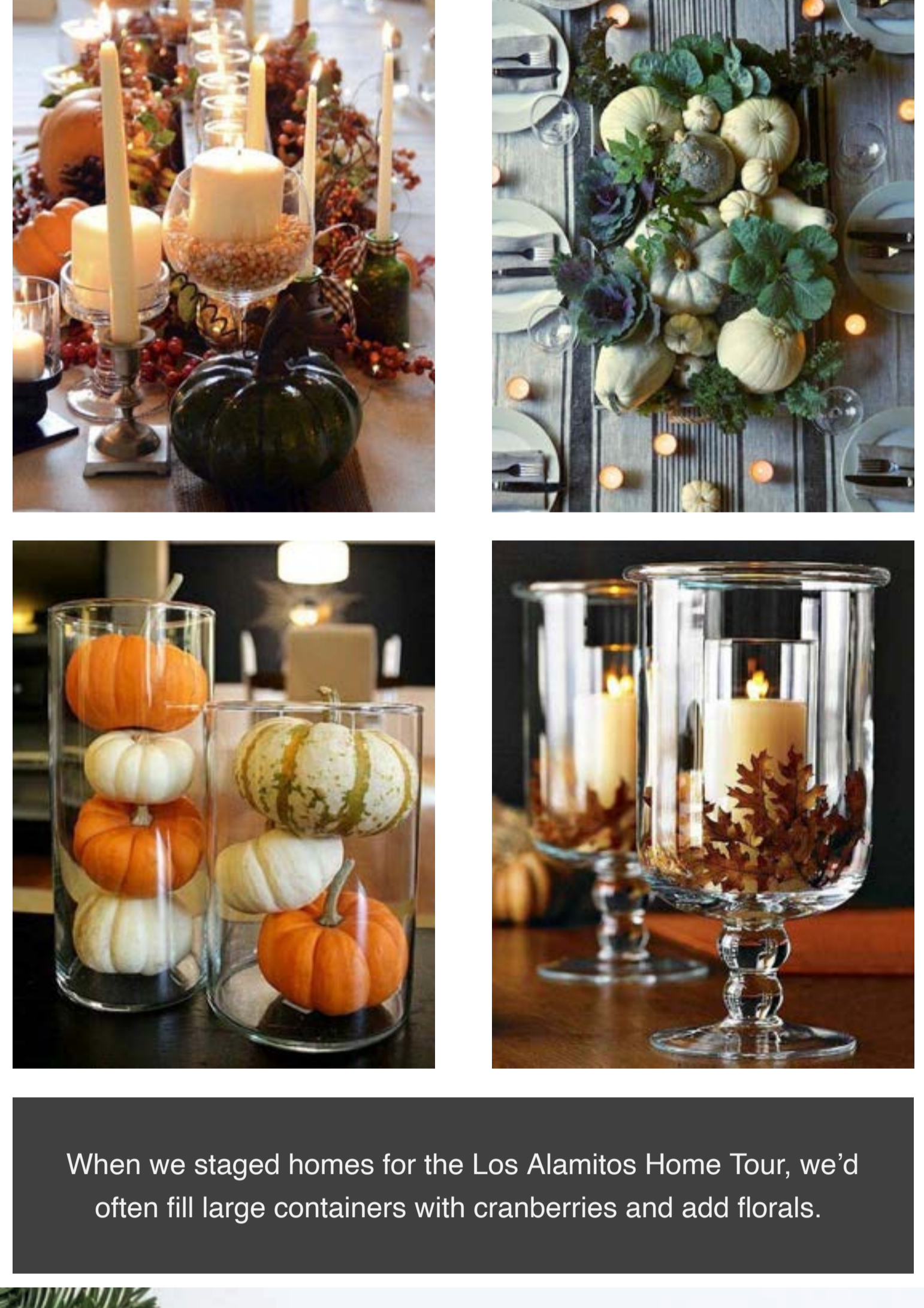
When we staged homes for the Los Alamitos Home Tour, we'd often fill large containers with cranberries and add florals.