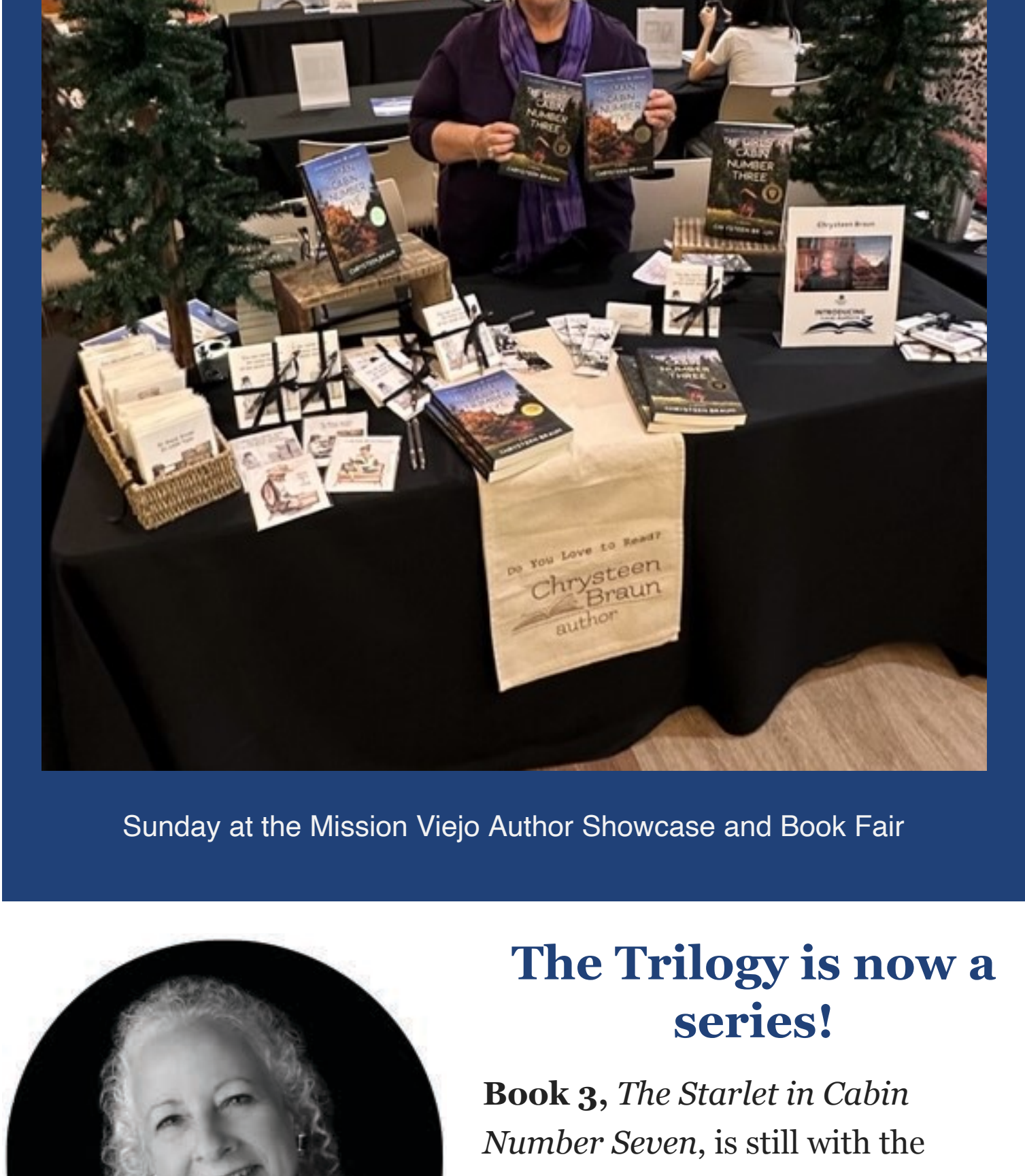
Sunday at the Mission Viejo Author Showcase and Book Fair