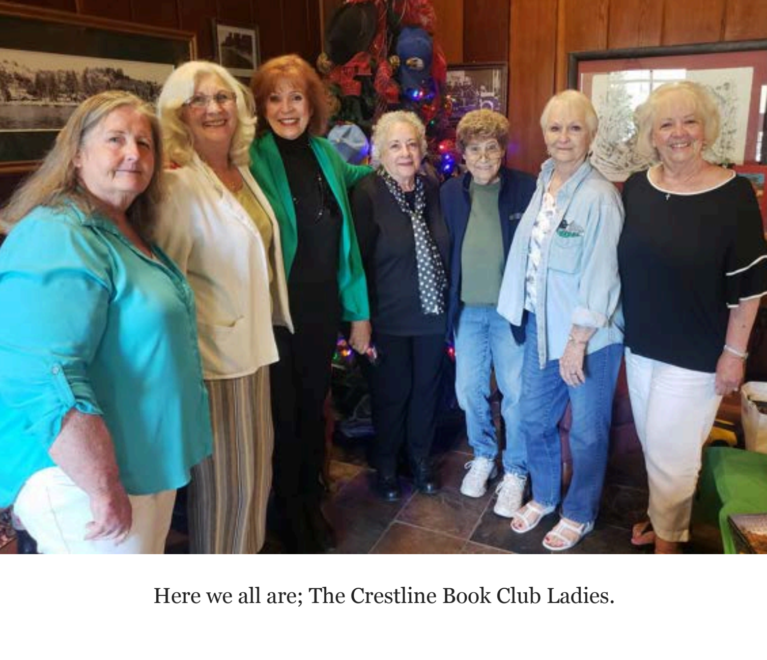
Here we all are; The Crestline Book Club Ladies.